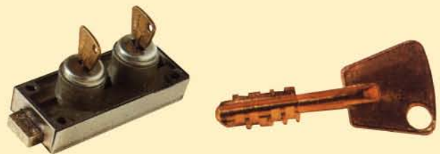
Dual Control Lock With 2 Key Locks

Note: Chubb safes policy is one of constant improvement. We reserve the right to alter any specification contained in this publication without prior notification. Variance \pm 5mm .